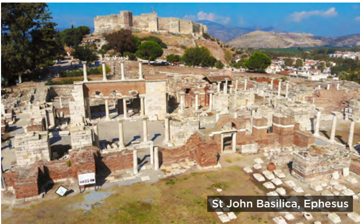
St John Basilica, Ephesus