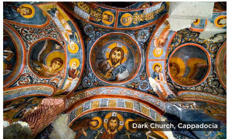
Dark Church, Cappadocia