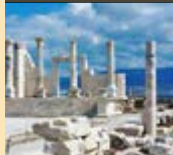
The letter to the church in Laodicea Rev 3:14-22