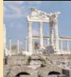
The letter to the church in Pergamum Rev 2:12-17