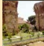
The letter to the church in Philadelphia Rev 3:7-13