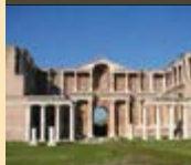
The letter to the church in Sardis Rev 3:1-6