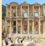
The letter to the church in Ephesus Rev 1:11; 2:1-7