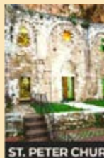
ST. PETER CHURCH