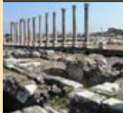
The letter to the church in Smyrna Rev 2:8-11