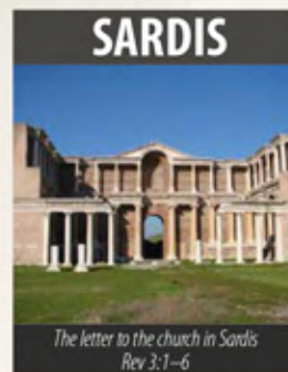
The letter to the church in Sardis Rev 3:1-6