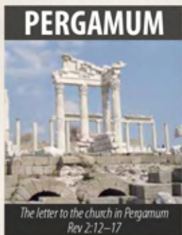
The letter to the church in Pergamum Rev 2:12-17