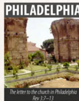
The letter to the church in Philadelphia Rev 3:7-13