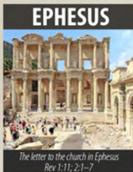
The letter to the church in Ephesus Rev 1:11; 2:1-7