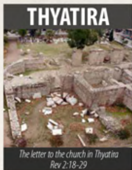
The letter to the church in Thyatira Rev 2:18-29