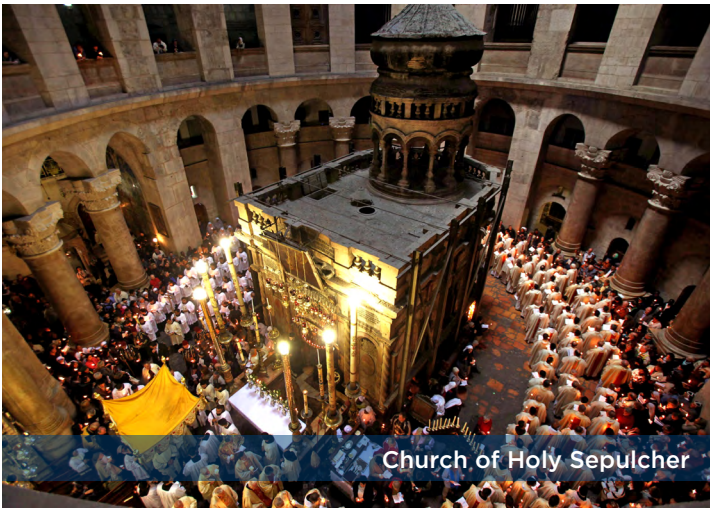
Church of Holy Sepulcher

and then walk down the hill to the Church of Saint Peter in Gallicantu where Peter denied Jesus. It was also the location of the palace of High Priest Caiaphas, where the Jewish trial of Jesus took place and where he was condemned to crucifixion (John 18:12-14, Matthew 26:57-58). We then walk down the hill by the City of David (2 Samuel 5:6-7) and enter the Old City to the Western Wall and the Temple Mount . We will also see the excavated Huldah Gates , the primary entrance into the Temple during the time of Jesus. Dinner and overnight at the Grand Court Hotel.