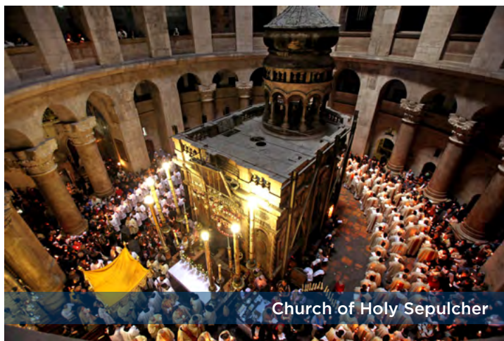
Church of Holy Sepulcher

and then walk down the hill to the Church of Saint Peter in Gallicantu where Peter denied Jesus. It was also the location of the palace of High Priest Caiaphas, where the Jewish trial of Jesus took place and where he was condemned to crucifixion (John 18:12-14, Matthew 26:57-58). We then walk down the hill by the City of David (2 Samuel 5:6-7) and enter the Old City to the Western Wall and the Temple Mount . We will also see the excavated Huldah Gates , the primary entrance into the Temple during the time of Jesus. Dinner and overnight at the Grand Court Hotel.