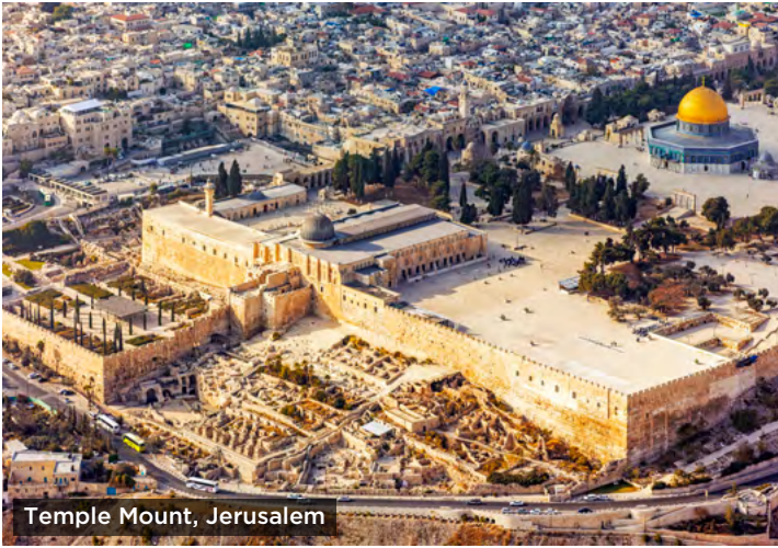
Temple Mount, Jerusalem