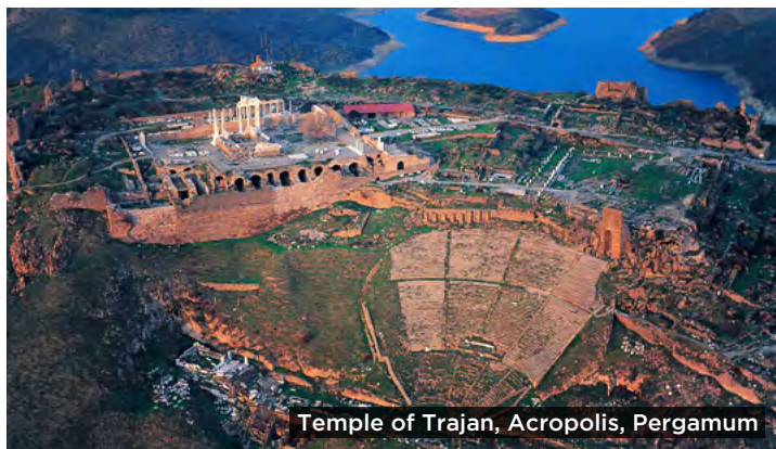
Temple of Trajan, Acropolis, Pergamum