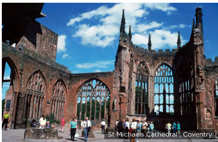
St Michael's Cathedral, Coventry