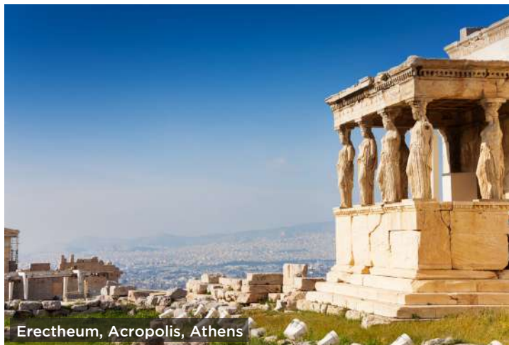
Erechtheum, Acropolis, Athens