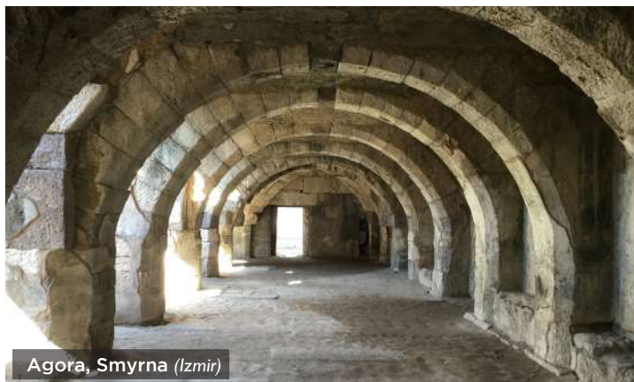
Agora, Smyrna (Izmir)

After breakfast we transfer to the airport for departure to USA - END (B)