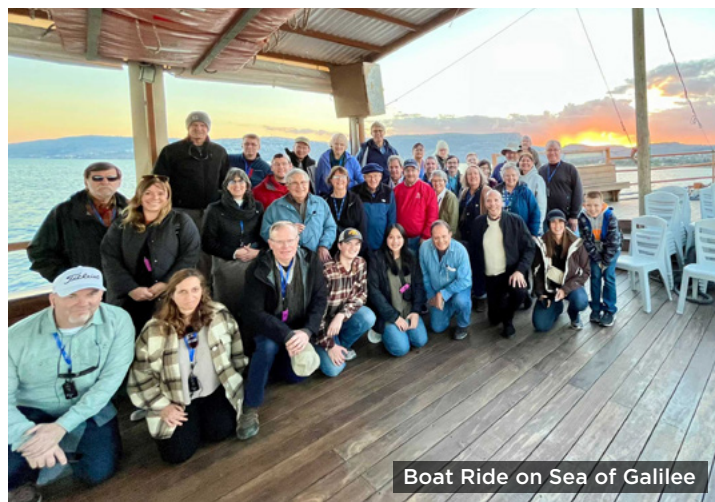
Boat Ride on Sea of Galilee

Today we travel north to visit Hazor, the largest Old Testament site in Israel ( a UNESCO World Heritage Site ). We will then proceed to Dan, the northern border of the biblical kingdom of Israel. There we will walk to one of the headwaters of the Jordan River and visit the extensive excavations. A short drive will take us to Caesarea Philippi, the place where Peter confessed that Jesus was the Christ ( Matt 16:16 ). From there we will drive up on to the Golan Heights and view into Syria ( if local conditions permit ). We end our day at Katzrin where we will visit the well-preserved Synagogue and reconstructed houses. Overnight in Tiberias (B,D).