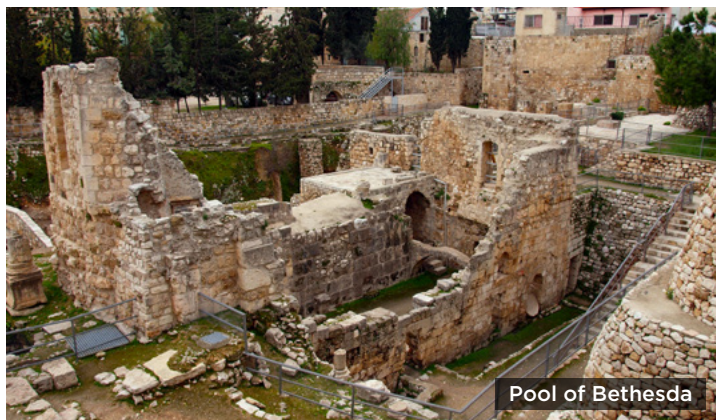
Pool of Bethesda

Transfer to Tel Aviv Airport for flight back to New York. End of services.