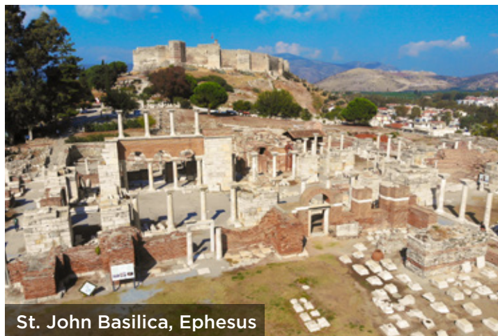
St. John Basilica, Ephesus