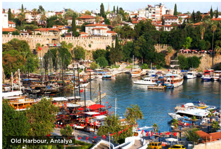
Old Harbour, Antalya