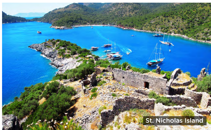
St. Nicholas Island

After breakfast in the hotel, visit the Greco- Roman city of Perga ( Acts 13:13 & 14; Acts 14:25), (aka Attalia, Acts 14:25). Stop at St Paul Cultural Center & Church for some brief free time and lunch. visit the award winning Antalya Archaeology Museum. Dinner and overnight Antalya . (B,L,D)