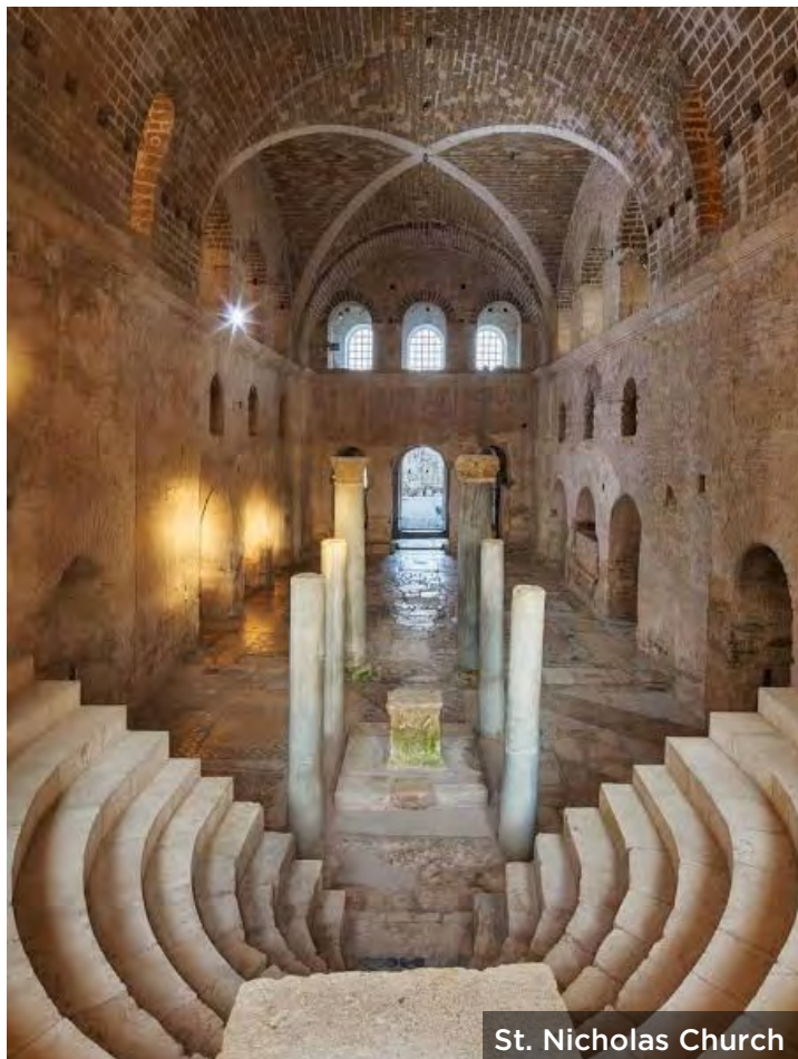
St. Nicholas Church