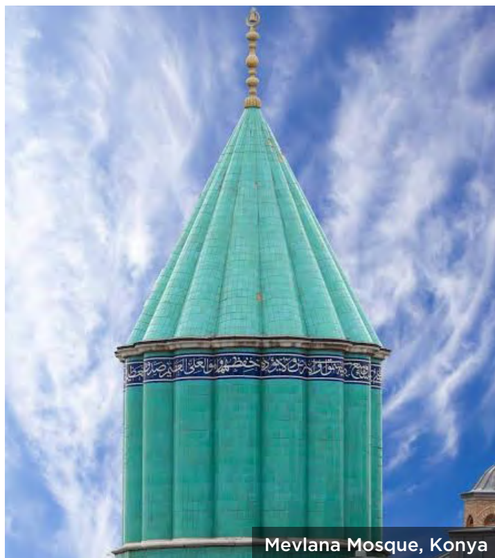
Mevlana Mosque, Konya

April 22 Mon We make an early start and head southeast to the city of Myra (Modern-day Demre ) where we visit the well preserved Byzantine basilica of St Nicholas, a place of pilgrimage to this day. After a boat trip and lunch, we visit the nearby Lycian cliff-tombs and Roman theatre, and the ancient port of Andriake . If time permits, one hour private boat tour . Overnight Antalya (B,D)