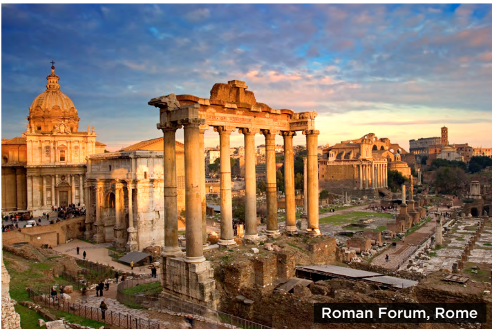
Roman Forum, Rome

Mar 2 Sun ROME Guided tour of Ancient Rome, including the Colosseum, Arch of Constantine, Roman Forum, Mamertine Prison, Church of San Giuseppe dei Falegnami (St. Joseph the Carpenter) . Lunch on your own. Visit the Capitoline Hill and Museums in the afternoon. Continue walking to Rome's famed Trevi Fountain, the Church of St. Ignazio, Pantheon and Santa Maria Sopra Minerva (Holy Mary Over Minerva) . Overnight in Rome. (B D)