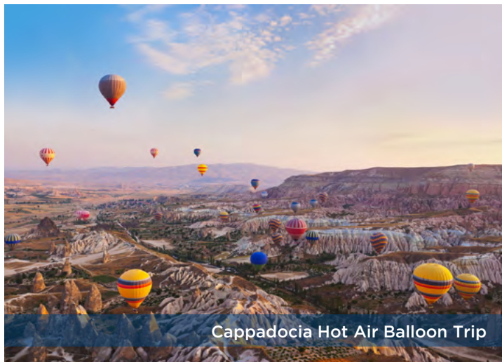
Cappadocia Hot Air Balloon Trip