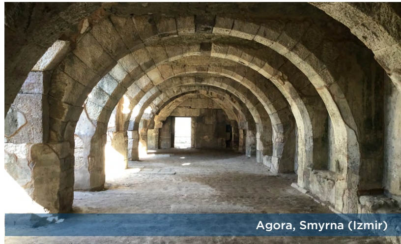
Agora, Smyrna (Izmir)