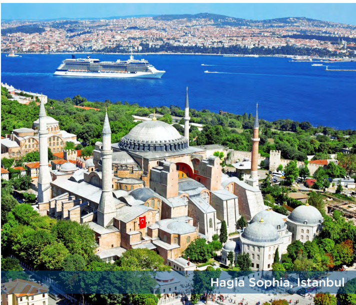
Hagia Sophia, Istanbul