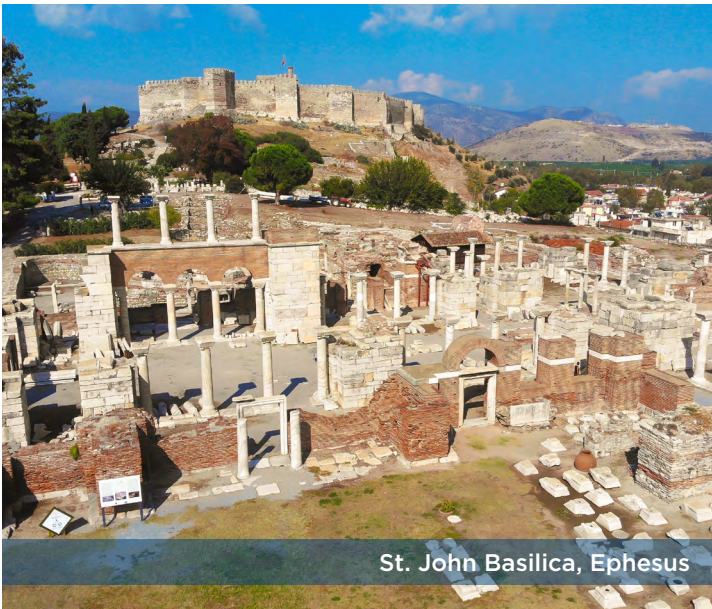
St. John Basilica, Ephesus