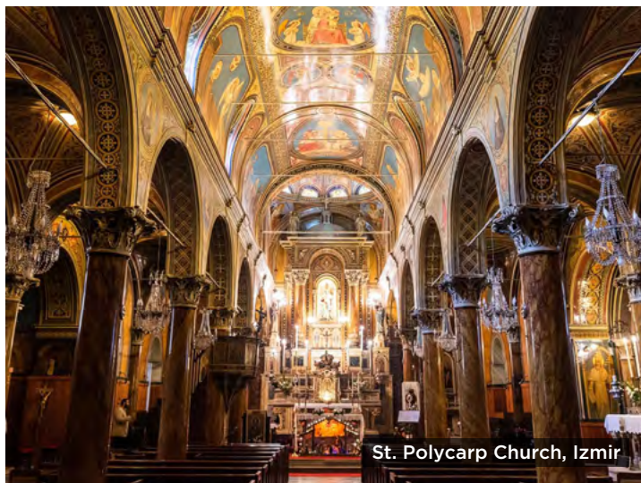
St. Polycarp Church, Izmir