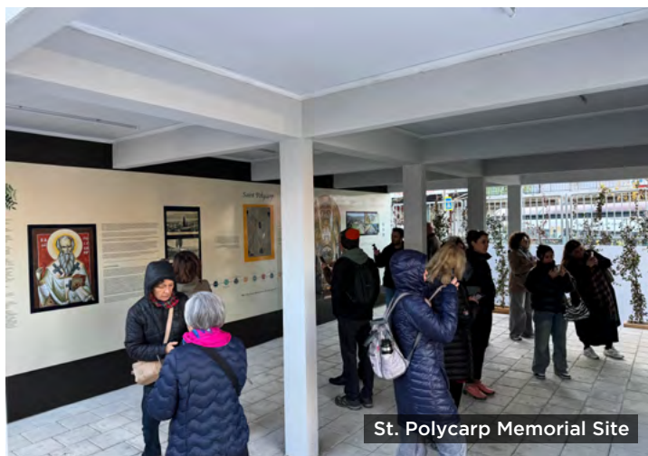
St. Polycarp Memorial Site