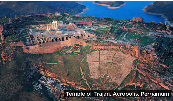
Temple of Trajan, Acropolis, Pergamum