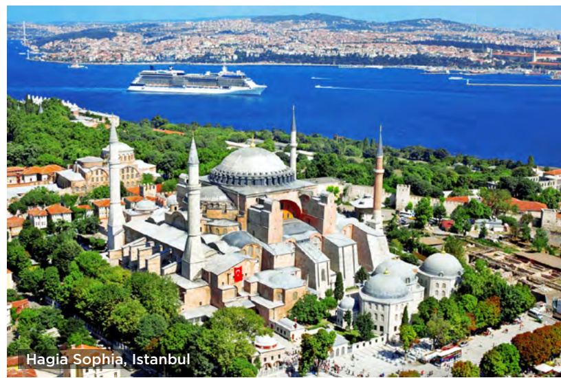
Hagia Sophia, Istanbul