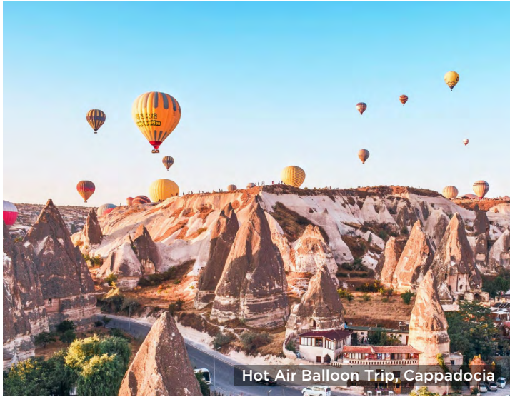
Hot Air Balloon Trip, Cappadocia