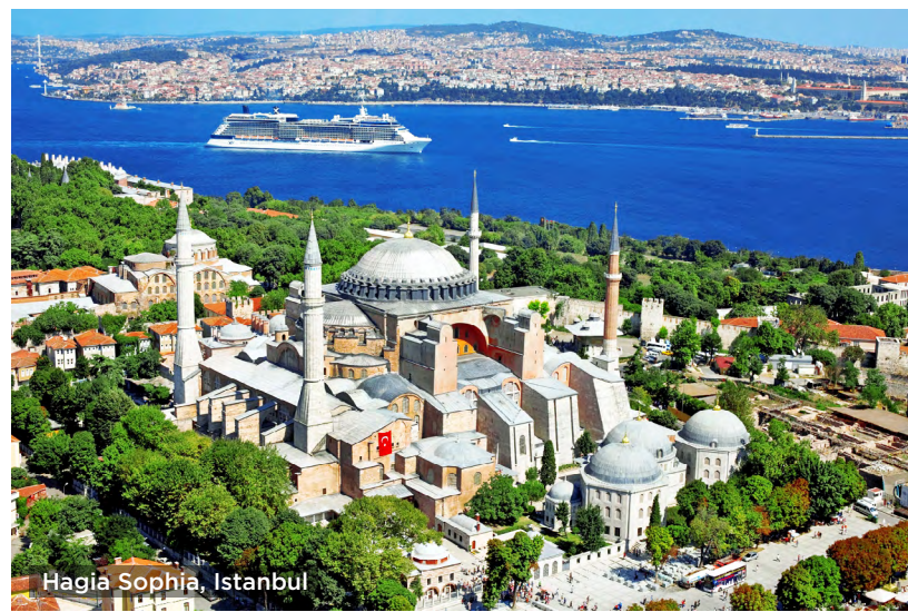
Hagia Sophia, Istanbul