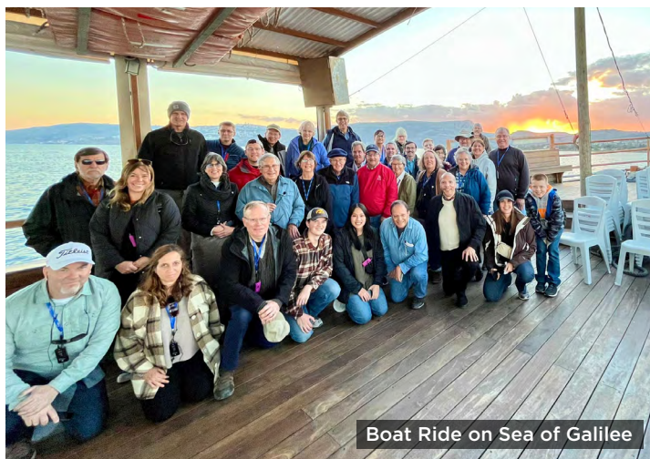
Boat Ride on Sea of Galilee

Today we travel north to visit Hazor, the largest Old Testament site in Israel (a UNESCO World Heritage Site). We will then proceed to Dan, the northern border of the biblical kingdom of Israel. There we will walk to one of the headwaters of the Jordan River and visit the extensive excavations. A short drive will take us to Caesarea Philippi, the place where Peter confessed that Jesus was the Christ (Matt 16:16). From there we will drive up on to the Golan Heights and view into Syria (if local conditions permit). We end our day at Katzrin where we will visit the well-preserved Synagogue and reconstructed houses. Overnight in Tiberias (B,D).