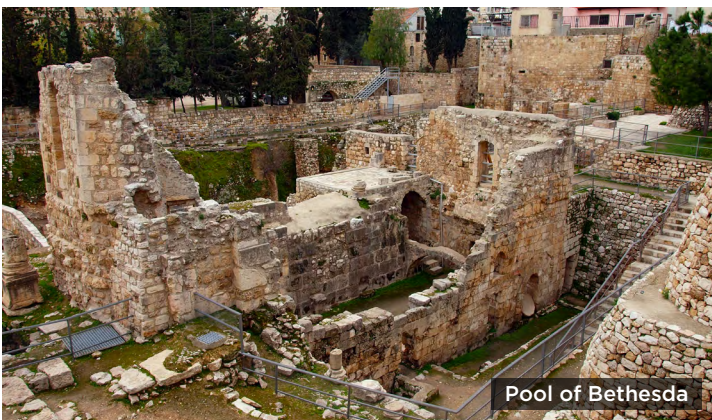
Pool of Bethesda

Transfer to Tel Aviv Airport for flight back to New York. End of services.