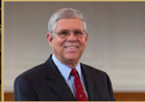
Dr. Ben Witherington III

Jean R. Amos Professor of New Testament for Doctoral Studies, Ph.D., University of Durham, England Asbury Seminary