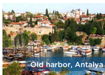
Old harbor, Antalya