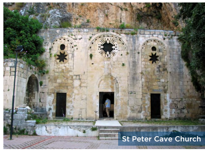
St Peter Cave Church