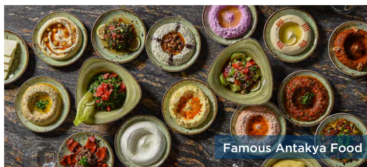
Famous Antakya Food

EXTENSIONS AVAILABLE TO: ISTANBUL, SEVEN CHURCHES, CAPPADOCIA, & more