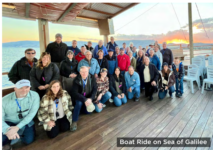
Boat Ride on Sea of Galilee

We will depart early in the morning and drive south down the Jordan Valley, beginning with a visit to Qasr el-Yahud, the traditional site where John baptized Jesus in the Jordan River. From there, we will continue to Qumran, where the Dead Sea Scrolls were discovered in 1947. Next, we proceed further south to Masada—the magnificent desert fortress built by Herod the Great overlooking the Dead Sea, where Jewish rebels held out against the Romans until A.D. 72/73. If time permits, we may also visit Jericho. We will conclude our day by driving up to Jerusalem. Dinner and overnight in Jerusalem. (B, D)