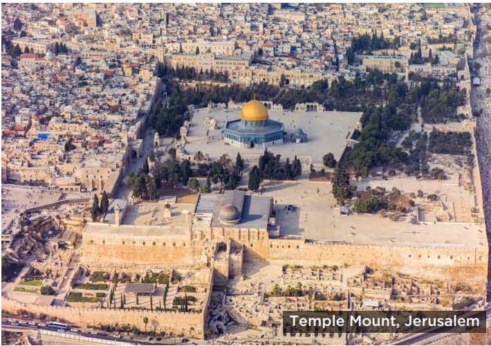
Temple Mount, Jerusalem