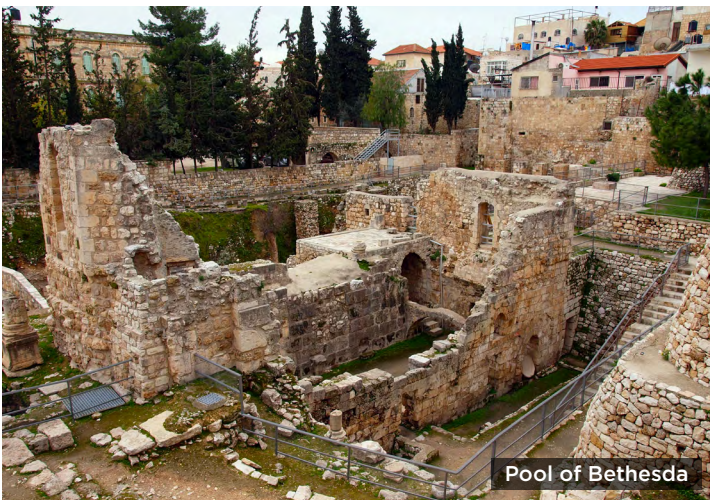
Pool of Bethesda

Transfer to Tel Aviv Airport for flight back to New York. End of services.