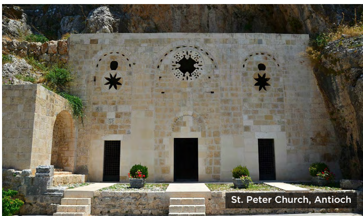
St. Peter Church, Antioch