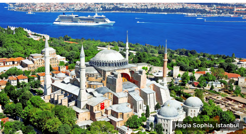
Hagia Sophia, Istanbul