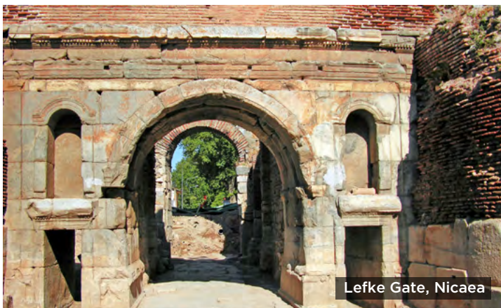
Lefke Gate, Nicaea