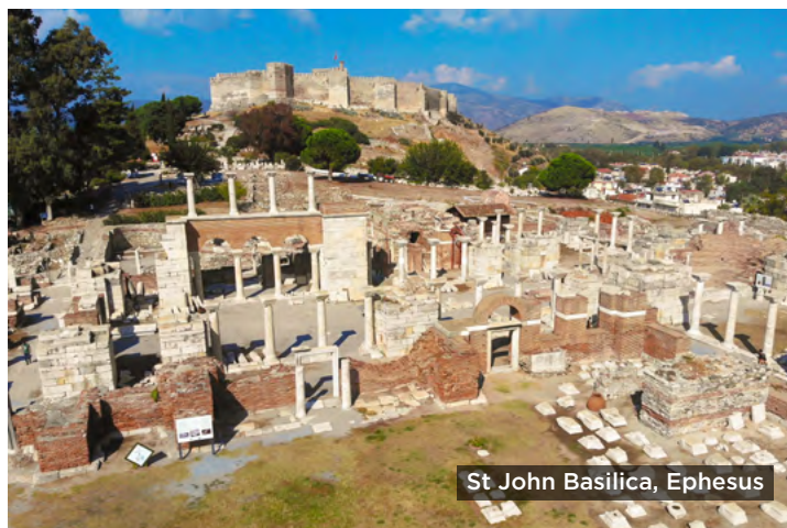
St John Basilica, Ephesus