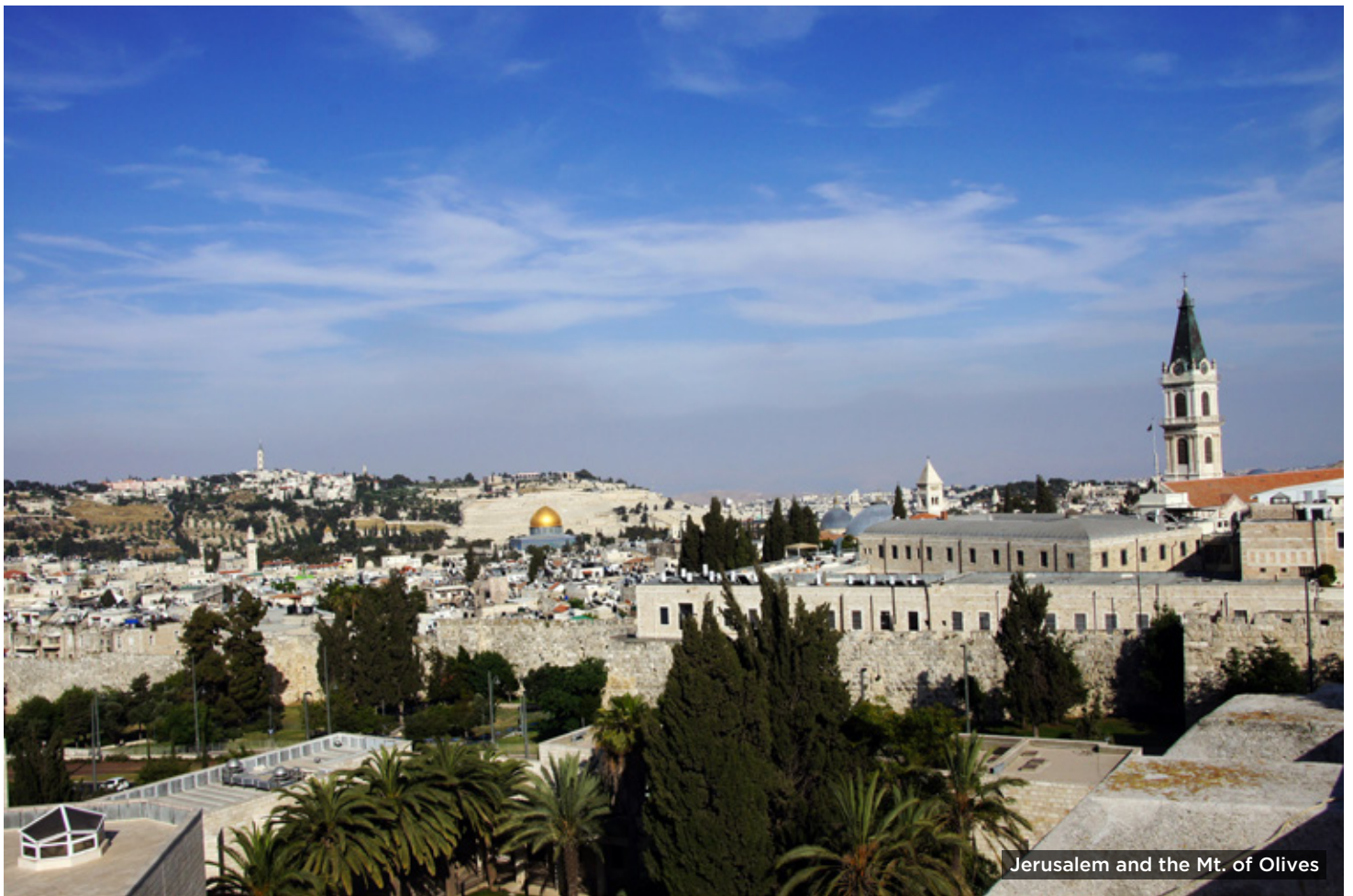
Jerusalem and the Mt. of Olives