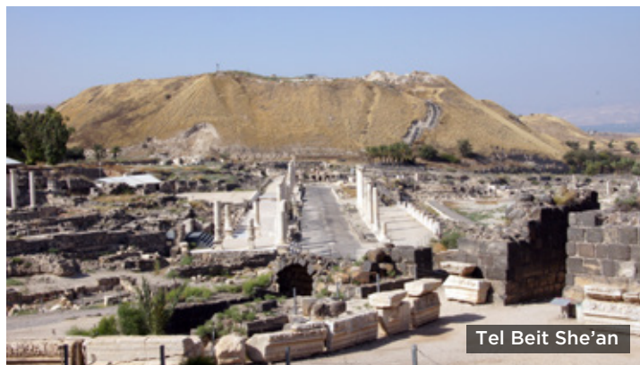
Tel Beit She'an