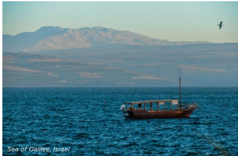
Sea of Galilee, Israel