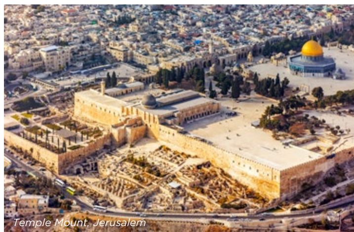
Temple Mount, Jerusalem

At Tel Aviv Airport, your guide will meet you with a "BEN WITHERINGTON - TUTKU" sign. Meet and transfer to hotel in Jerusalem for check-in. Rest of the day is free. Dinner and overnight at the hotel in Jerusalem. (B,D)