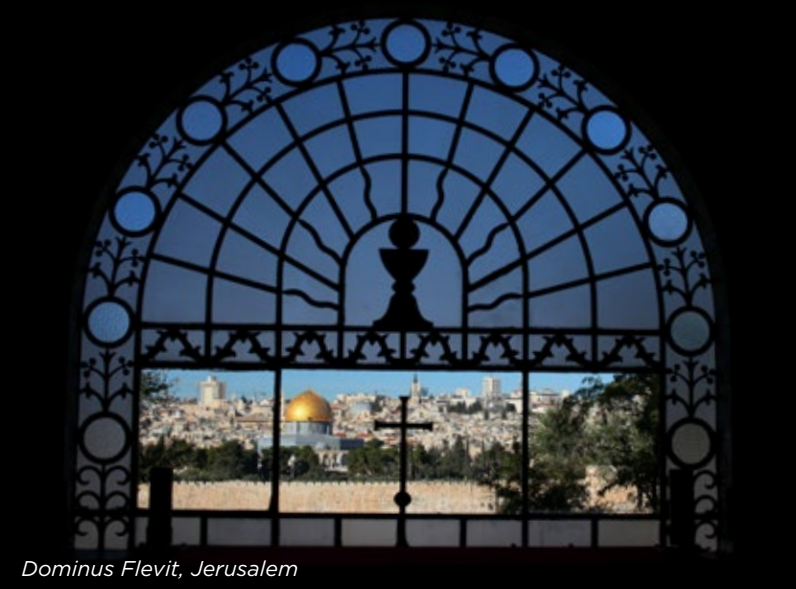
Dominus Flevit, Jerusalem