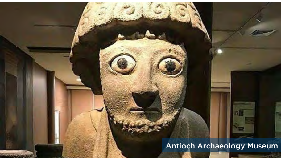
Antioch Archaeology Museum