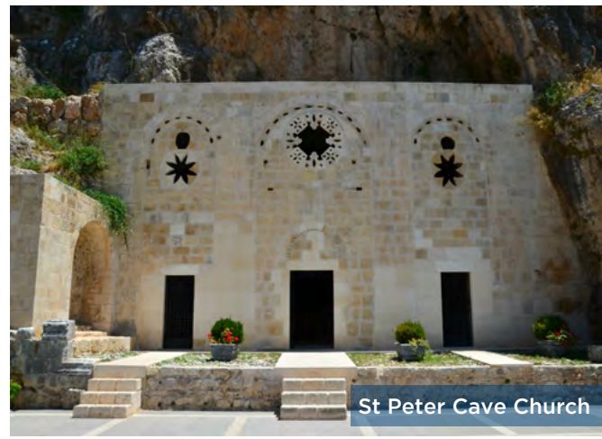
St Peter Cave Church