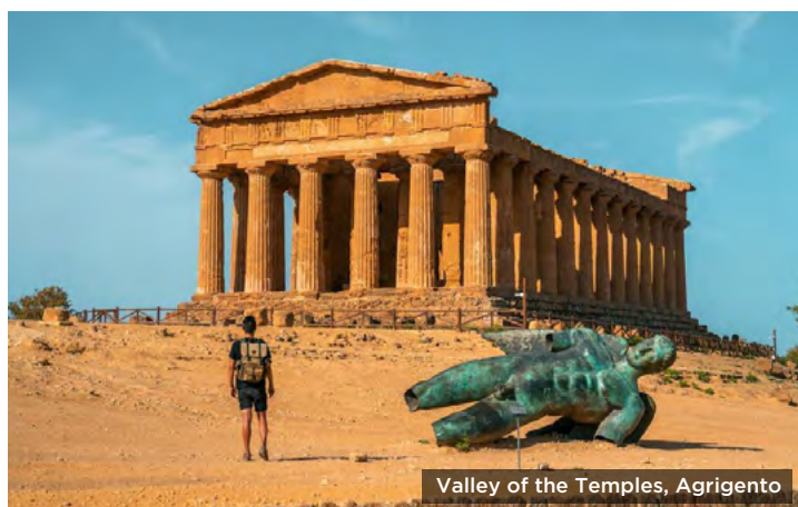
Valley of the Temples, Agrigento

DL 066 27APR ATLFCO 1955 1135 DL 215 07MAY FCOATL 0915 1425