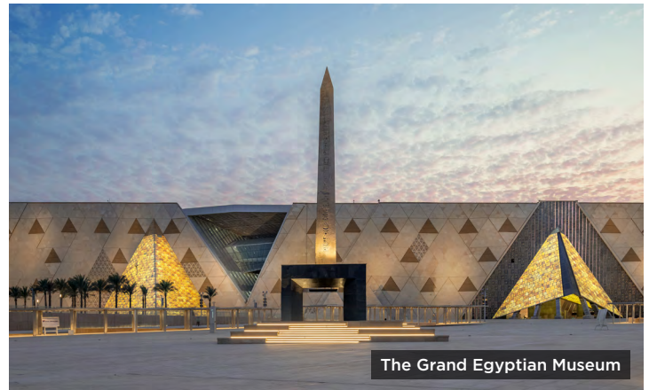
The Grand Egyptian Museum