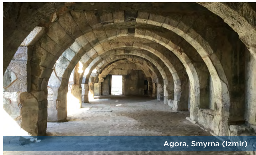
Agora, Smyrna (Izmir)