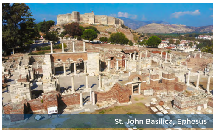
St. John Basilica, Ephesus

Day 9 (Thursday Oct 15) Antioch After breakfast we will meet with Turkish believers at their church camp, and spend the day with them. We will hear about their experiences after the earthquake, and their mercy ministry of outreach in providing meals and water to the people. We will also visit others in the city. After dinner at our hotel, we will join the Turkish believers again for worship and activities. (The Museum Hotel).