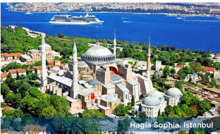
Hagia Sophia, Istanbul

Day 14 (Tuesday Oct 20) Departure to USA After breakfast we drive (one hour) to the Istanbul Airport where we board our international flights back to the USA. The tour and services end.