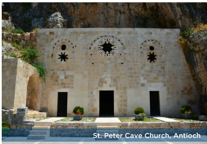
St. Peter Cave Church, Antioch