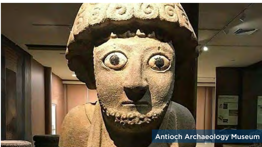
Antioch Archaeology Museum