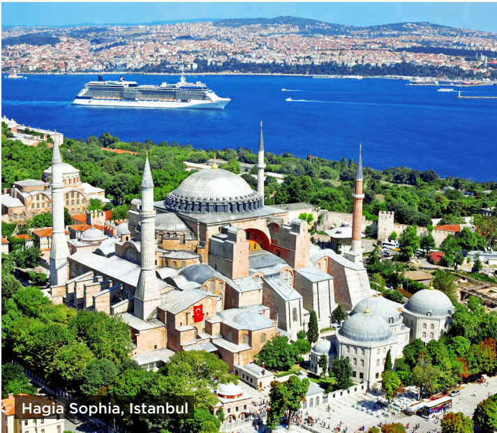
Hagia Sophia, Istanbul