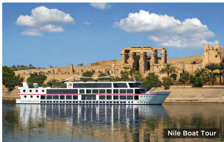
Nile Boat Tour