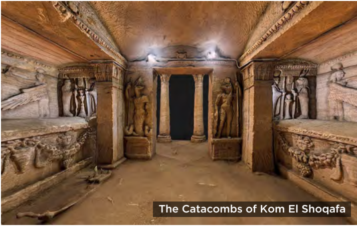
The Catacombs of Kom El Shoqafa