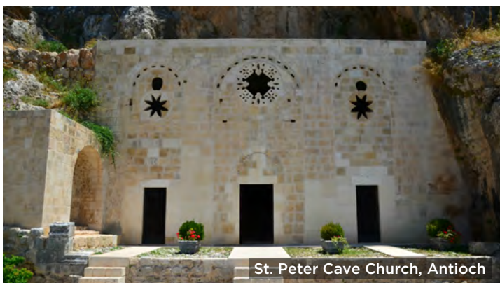
St. Peter Cave Church, Antioch