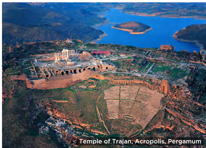
Temple of Trajan, Acropolis, Pergamum