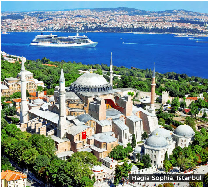
Hagia Sophia, Istanbul