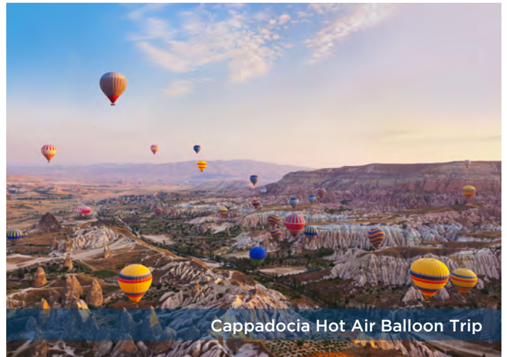
Cappadocia Hot Air Balloon Trip