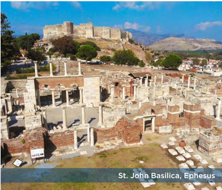
St. John Basilica, Ephesus