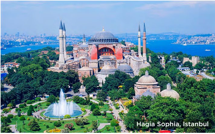
Hagia Sophia, Istanbul