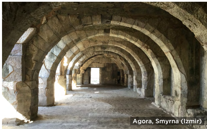
Agora, Smyrna (Izmir)

After breakfast we tour the archaeological biblical city of Ephesus , a magnificently preserved ancient Greco-Roman city. We will walk through the spectacular first-century Terrace Houses , where the early house churches of Ephesus likely met. Those who are interested can visit a local Anatolian Handmade Carpet and Kilim production center to learn how world-famous Turkish carpets are made, and buy one if you desire. Those who don't want to visit the Carpet center can return to the hotel for free time, and enjoy the Aegean beach. Dinner and overnight at the Korumar Deluxe Hotel.