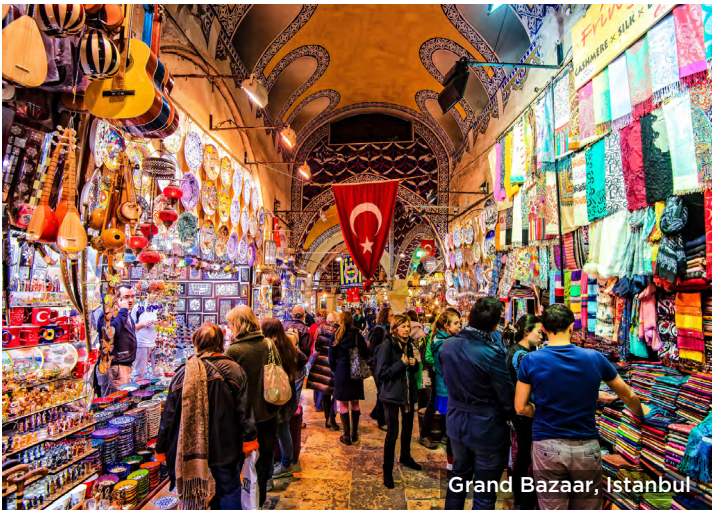
Grand Bazaar, Istanbul

After breakfast we drive to the Istanbul Airport where we board our international flights back to the USA.